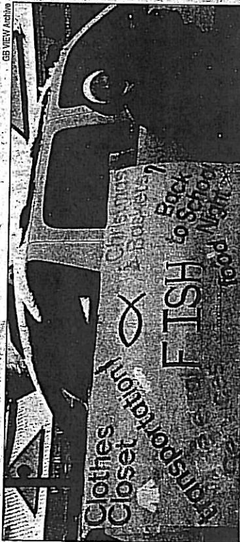
GB VIEW ARCHIVE

The annual Christmas Basket project includes baskets with toys and enough food, including a turkey, for Christmas dinner. FISH has around 135 families asking for assistance this holiday season, but that number will rise before FISH delivers the